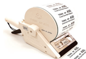
AP65-100 using AP-A35-100