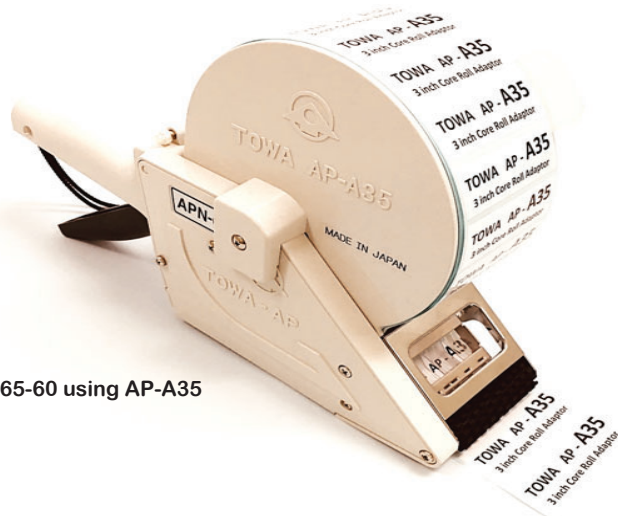
AP65-60 using AP-A35