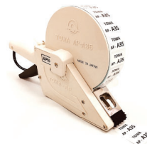
AP65-30 using AP-A35